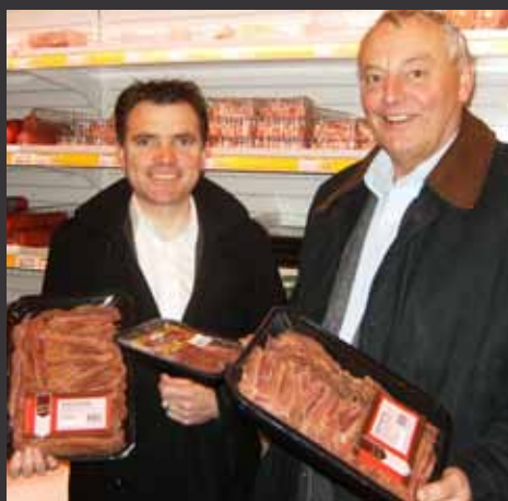
Mourne Country Meats view cooked bacon and cold cuts as ingredients for the Dutch convenience and sandwich industry