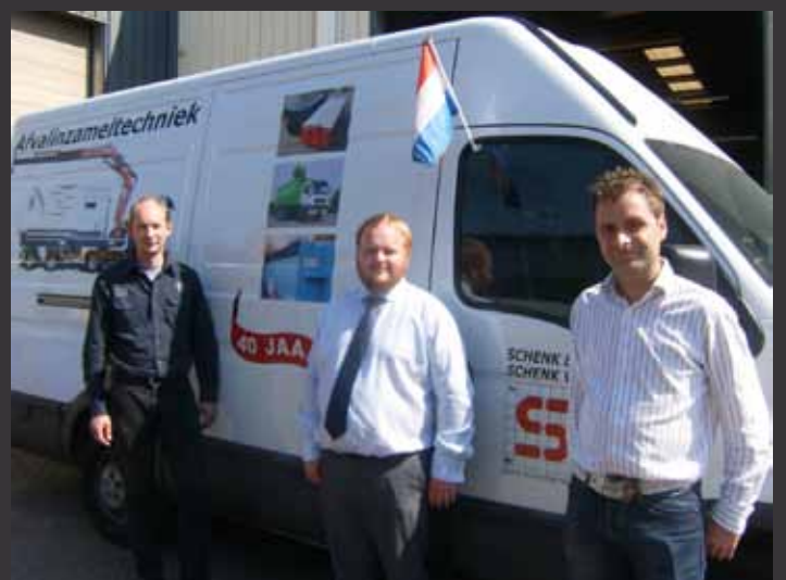
BMI Trailers congratulate newly appointed Dutch dealer Schenk BV on their 40th year in business, and look forward to working together in 2011.