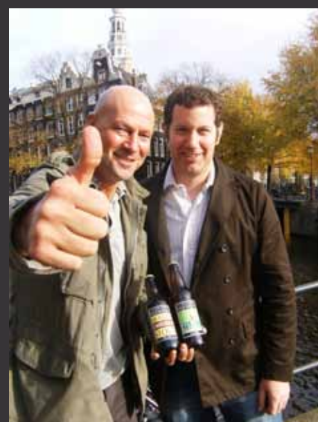
Dutch chef and TV presenter Rene Pluijm gives the 'thumbs up' to Hilden Brewery's College Green bottled beers.