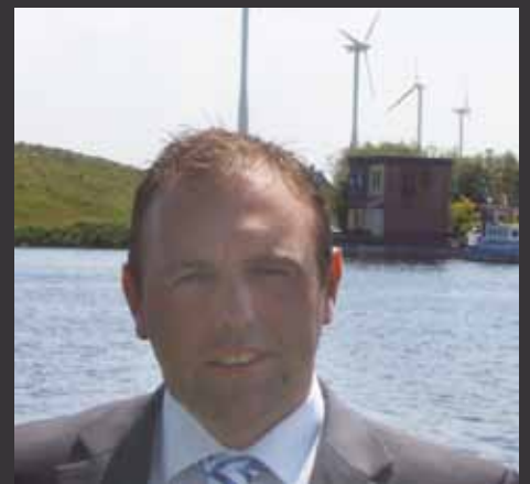
Limavady Gear company investigate gearbox revision project in the Netherlands