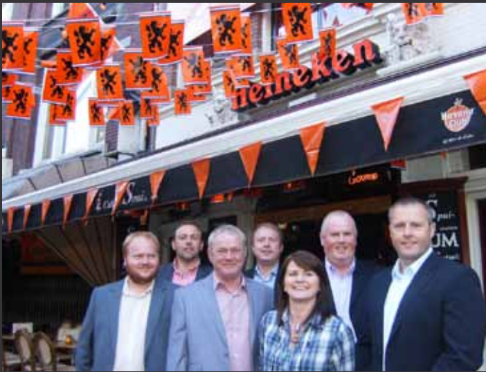
Northern Ireland companies arrive in Amsterdam during the build up to the World Cup