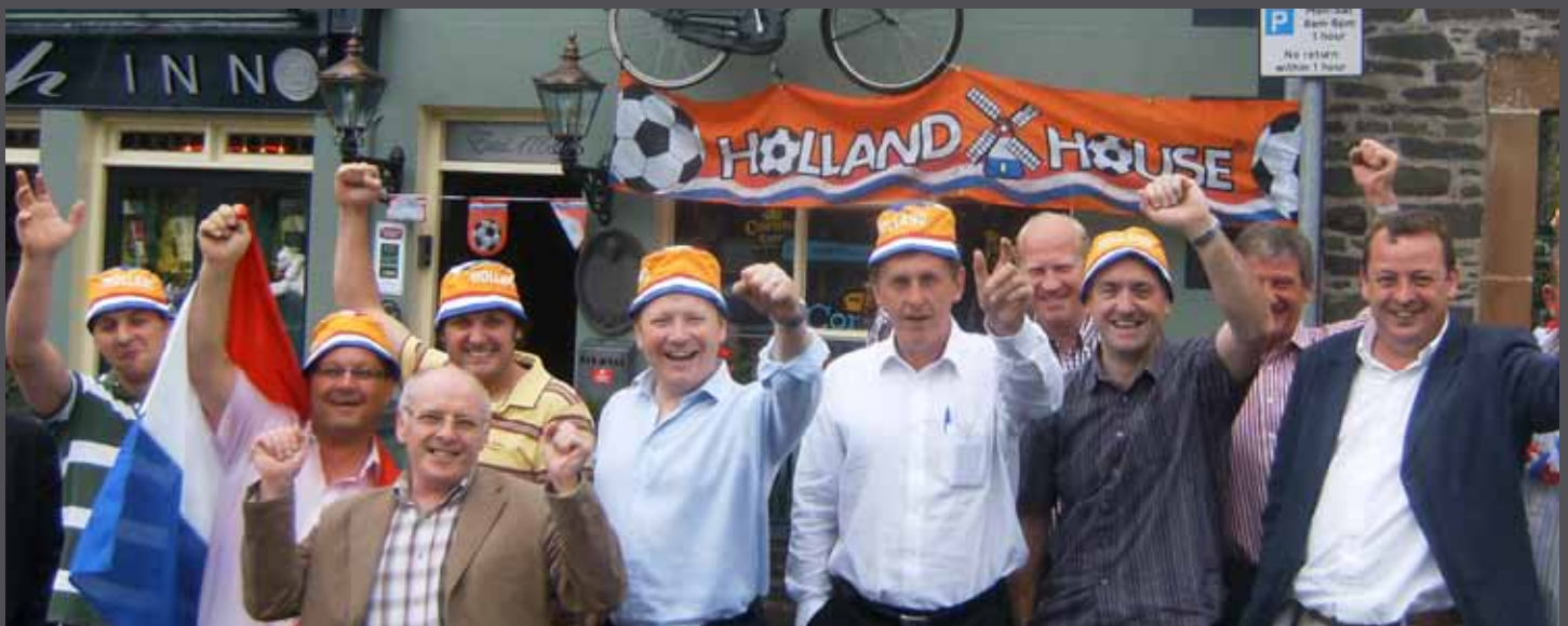
The Plough in Hillsborough temporarily became the Holland House for supporters