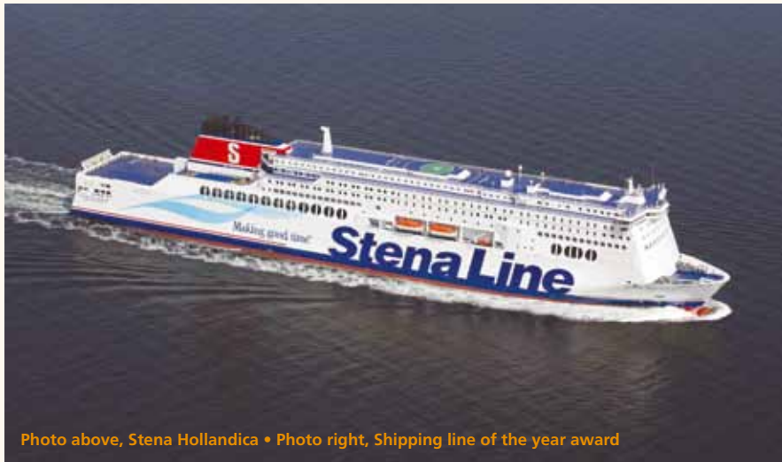
Photo above, Stena Hollandica • Photo right, Shipping line of the year award

Despite the current economic conditions, Stena Line www.stenaline.com has continued to invest heavily in its fleet and services. As a leading ferry company, it has made the largest investment on its Irish Sea routes in years having recently begun work on a new £200m Scottish Port, introduced the Stena Navigator on the Belfast to Stranraer route with an investment of over £6m and completed a £9m makeover on their Irish Sea vessels. The ferry company has also launched two of the world's biggest Superferries on the North Sea, The Stena Hollandica and the Stena Britannica with a total investment of over £375m