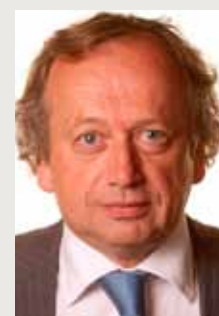
Henk Bleker Minister for Agriculture and Foreign Trade

In 1999 Dr Bleker became a member of the provincial executive of the province of Groningen. He covered health care, transport, agriculture, nature and the organisation of local government. In 2009 he left to become director of the regional broadcaster RTV Noord. On 14 October 2010 Dr. Bleker was appointed Minister for Agriculture and Foreign Trade in the Rutte-Verhagen government. Henk Bleker began his involvement with provincial government in 1982. From 1982 to 1999 he was a member of Groningen provincial council, representing the Christian Democratic Alliance (CDA).