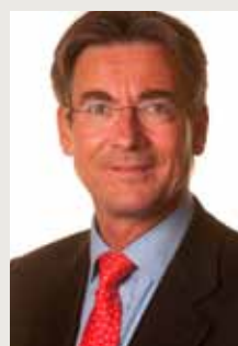
Maxime Verhagen Deputy Prime Minister, Minister of Economic Affairs, Agriculture and Innovation

On 14 October 2010 Mr Verhagen was appointed Minister of Economic Affairs, Agriculture and Innovation in the Rutte-Verhagen government.