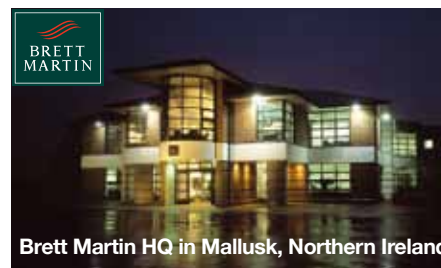
Brett Martin HQ in Mallusk, Northern Ireland