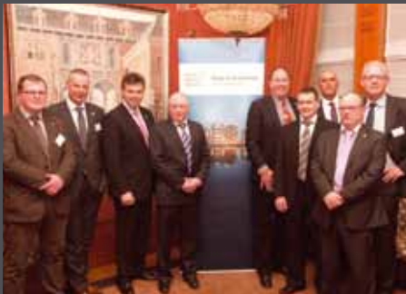
C&J Meats Directors and their Dutch partner Shannon Meats ensure that Shannon Matured beef is on the menu for their retail and HoReCa clients