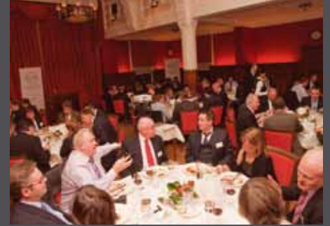
Diners enjoy a convivial atmosphere