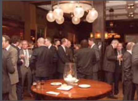
Northern Ireland and Dutch companies enjoy the opportunity of networking prior to dinner at De Industriële Club, Amsterdam.