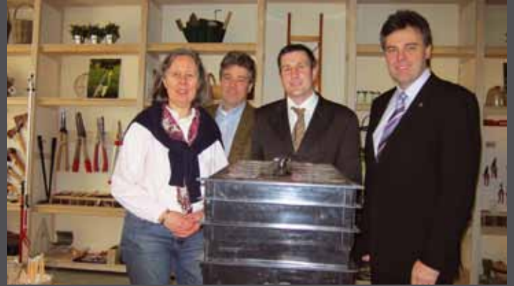
High end garden equipment supplier De Wiltfang who has taken on distribution for Wormworks wormery to the garden trade in the Netherlands.