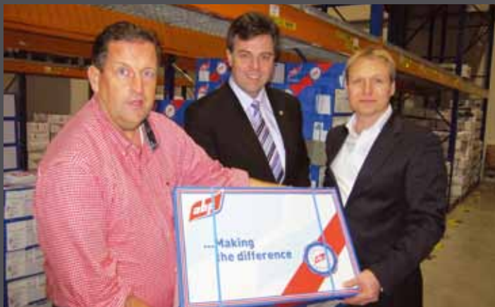
Dutch meat importer Groenveld Vlees who has developed a strong working relationship with ABP of Newry since participating on an Invest NI trade mission in early 2009.