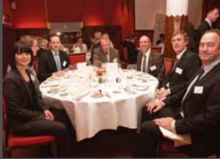
Lisburn companies Craigs, Cutting Industries, Star Instruments and guests seated for dinner