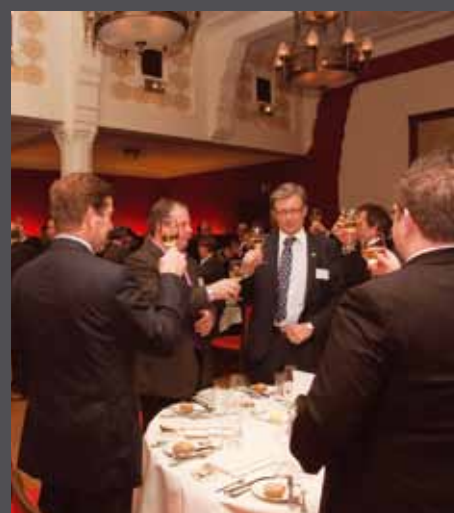
NI and NL companies toast continued success of bi-lateral trade links