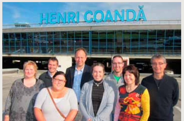
A delegation of fourteen Northern Ireland exporters visited Romania and Bulgaria in November. Pictured at Otopeni International Airport, Bucharest