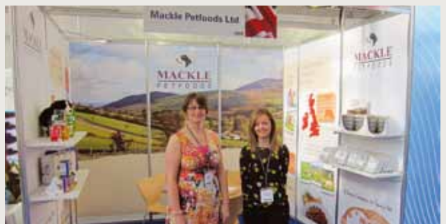
Back to back shows for Mackle Petfoods from Interzoo in Germany to PLMA in The Netherlands