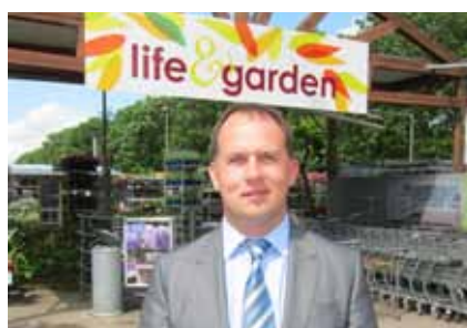
Clinivet - a brand of dry Super Premium Pet Nutrition sold through pet stores and through veterinary practices.