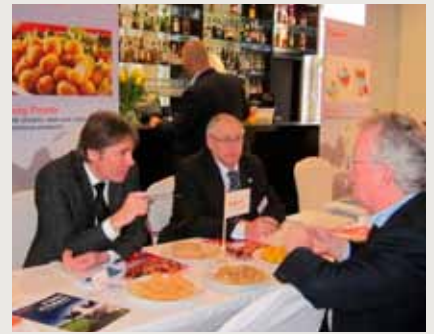
...and more Speed Dating