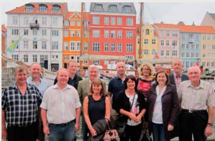
23 companies crisscross the four Nordic countries during 5 days in September. Pictured on arrival in Copenhagen in Nyhavn (New Harbour)