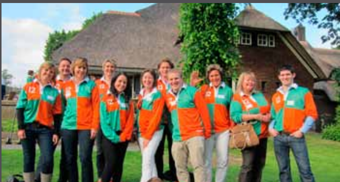
Tourism Ireland guests enjoy the surroundings of the Old Amsterdam Course Clubhouse.