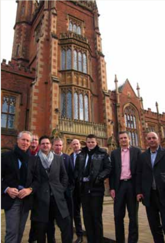
NI-NL New Year's Dinner in Belfast