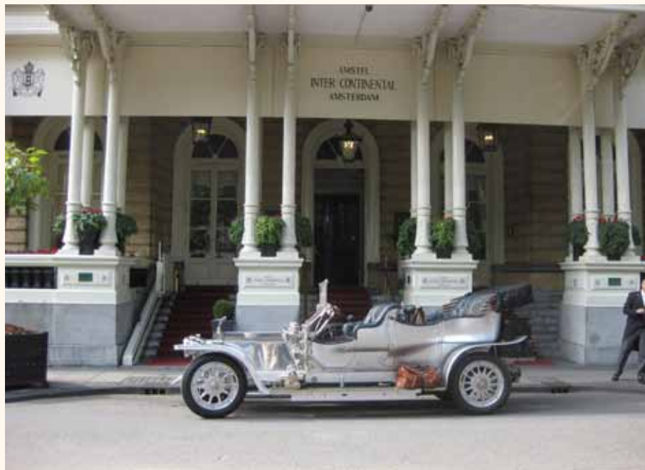
A photograph of the magnificent car is captured on the steps of the luxurious five-star Amstel Hotel, Amsterdam, which offers incomparable tradition and excellence .... just like James Black Restorations.