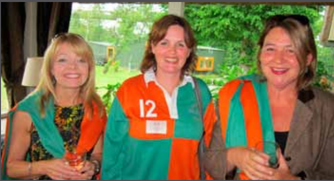
Football is a not only a man's game!