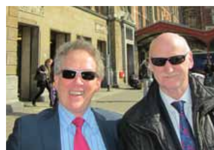
WRX Eyeworks - supplier of 100 different styles, shapes and colour variants of eyewear (optical frames and sunglasses) as branded collections, choose the perfect week to test the market for 'shades' in major Dutch cities