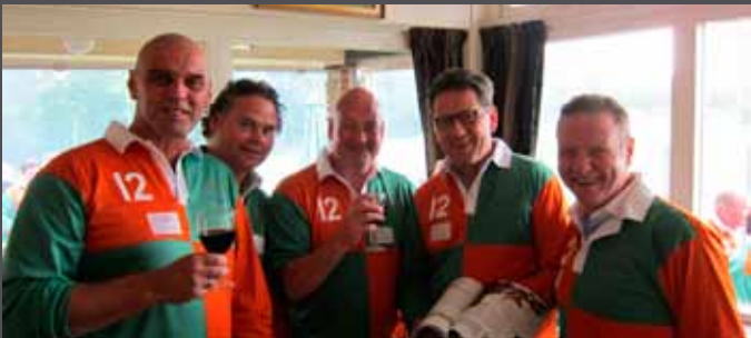
Meat men and kitchen experts exchange notes.