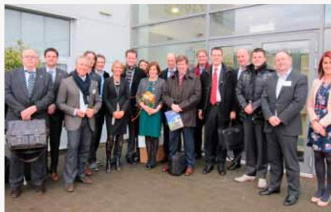
Group Meet the Buyer events