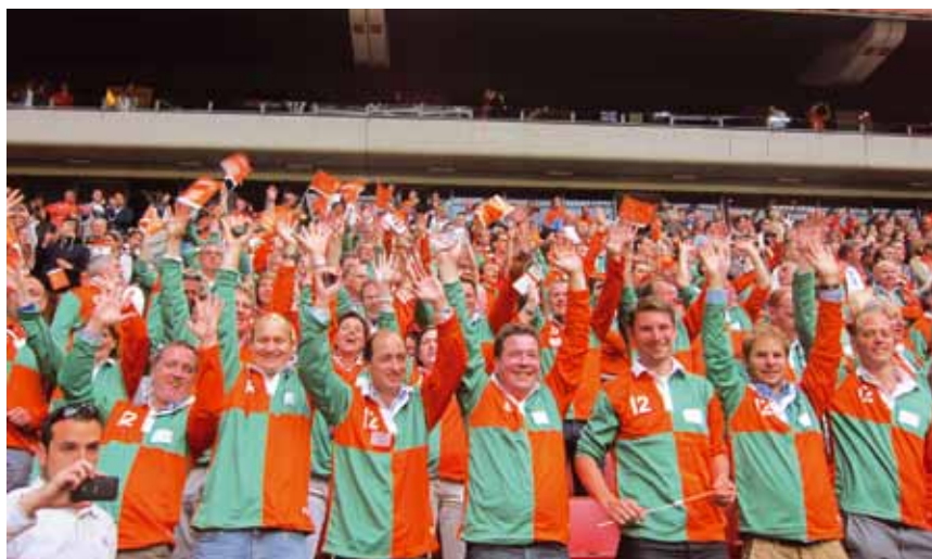
June 2012 - NI and NL businesses don joint colours for the Summer Networking, BBQ and International football friendly at the Amsterdam Arena.