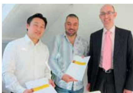
OMJ - developer of specialist software to bulk oil trading organisations with online real time information on NW European prices based on the Rotterdam spot market - demos their real time system.