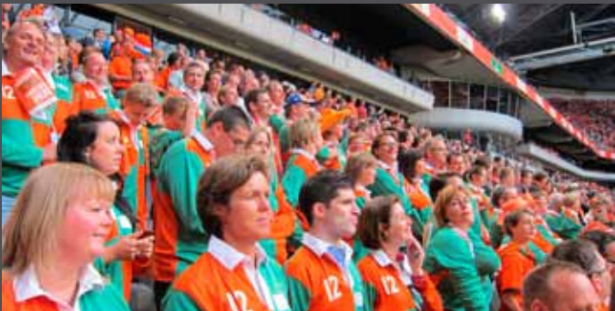
NI-NL guests cover their options by supporting both teams.