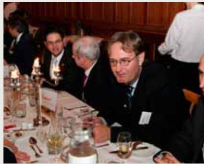
NI-NL New Year's Dinner