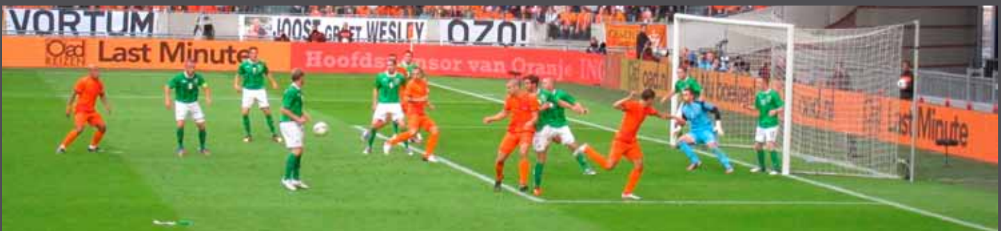
10 Northern Ireland players in the box defending against a strong Dutch team