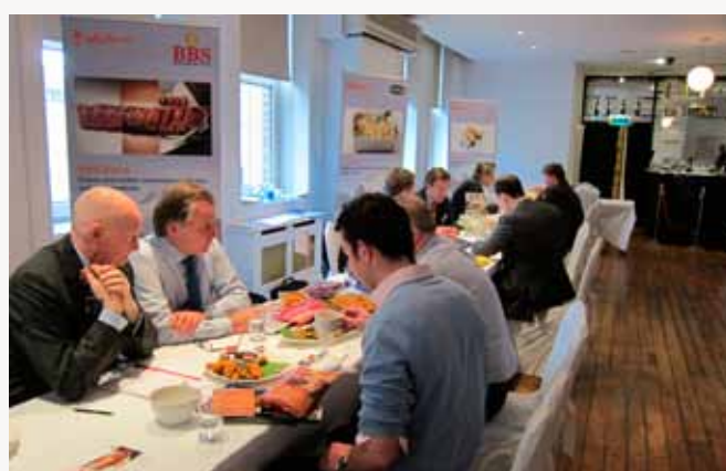
A Taste of Holland 'Speed dating'