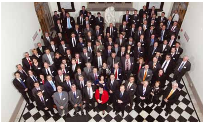
January 2012 - Largest gathering of Dutch industrialists in the province to attend the NI-NL New Year's Trade Dinner with their local business partners.