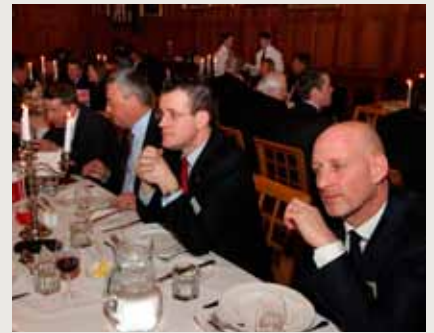
NI-NL New Year's Dinner