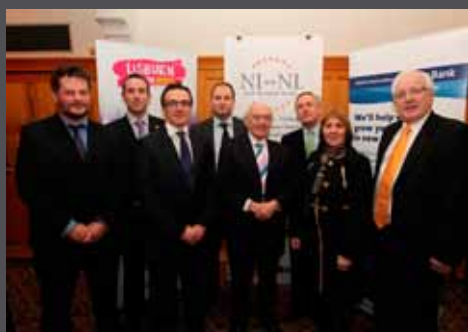
Representatives of Lisburn City Council with local companies Decora Blind Systems, Boomer Industries and Linton Solutions.