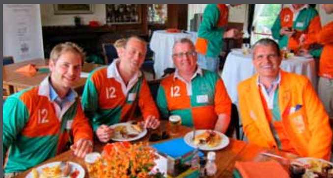
Football Fans and business partners, Aenova with Mobile Technology

The Summer Networking event allowed companies time to relax and network together whilst at the same time developing Northern Ireland - Netherlands trade relations. Many thanks to all the sponsors involved, as well as the Amsterdam Old Course, the IFA and Dutch KNVB for facilitating such a memorable day. After the BBQ there was an opportunity to taste Bushmills whiskey, produced at Ireland's oldest working distillery in County Antrim.