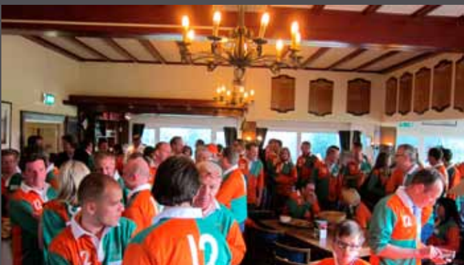
Guests network in the clubhouse prior to the football match