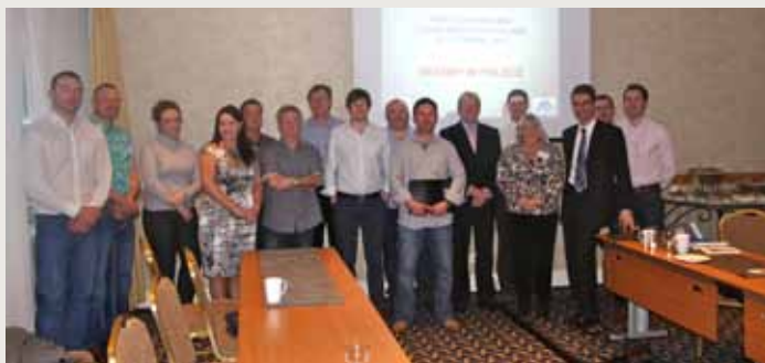
18 Northern Ireland companies assessed and access the Polish market from the mission centres in both Warsaw and Krakow