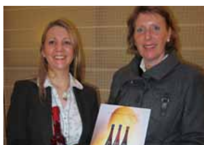
Spirited Drinks - the company behind Ireland's 1st berry Ruby Blue Liqueur available in 3 flavours - present their products to a leading Dutch off licence chain