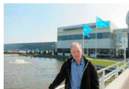
Linton and Robinson - a specialised supplier of dairy and slurry based farming solutions including the the ASBS Slurry Aeration System