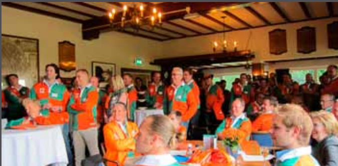
Pep talk for the fans before leaving for the Amsterdam Arena