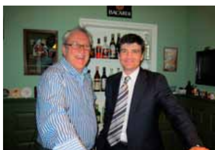
Alfees - Producer of tasty handheld flatbread snacks for 'Out of Home' consumption - meet with specialists in frozen food sales