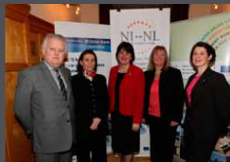
Representatives and invited guests of Tourism Ireland Amsterdam meet with Minister Arlene Foster.