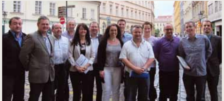
Fourteen companies from a range of sectors participated on the Trade Mission which was centred in Prague in June