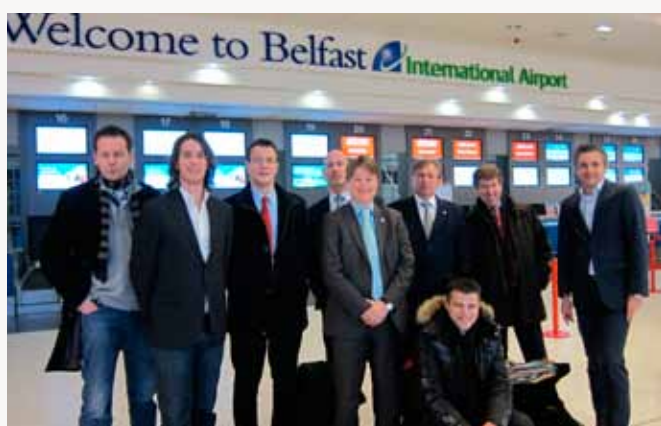
Travelling 'en groupe'